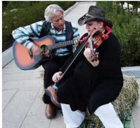
Western music greeting at the entry