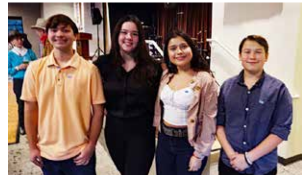
San Marin High Rotary Interactors provide Western BBQ Table support and Auction help.