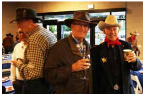
Cowboy hats set the mood