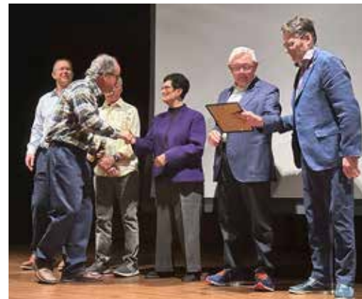
The Mayor recognizing the Rotary Club of Novato, Ignacio Rotary Club, and the Novato Historical Guild for the Novato Speakers Series.