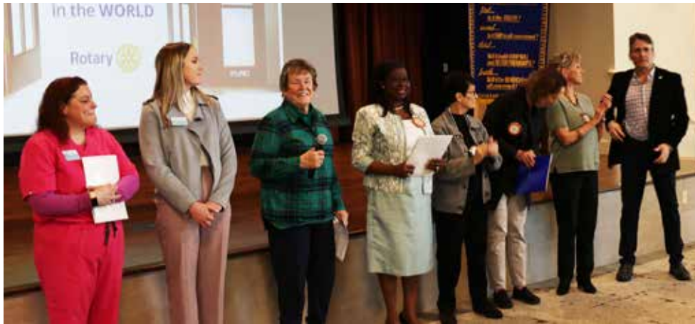
Our three new members inducted.