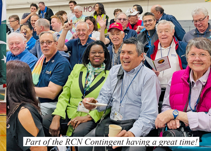
Part of the RCN Contingent having a great time!