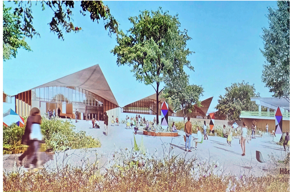
A rendering of the exterior of the Eames Institute of Infinite Curiosity which will be located in the former Birkenstock building in northern Novato.