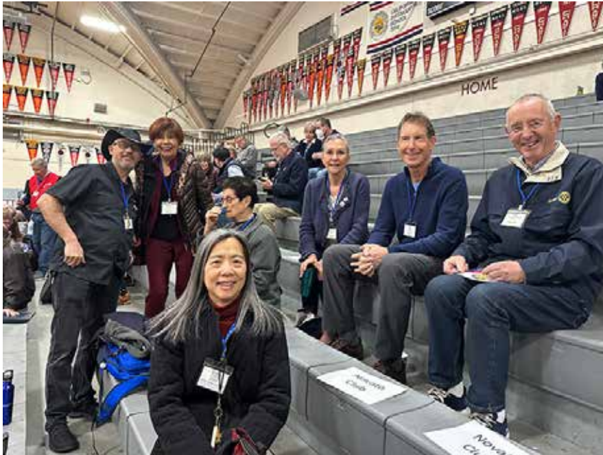
Saturday's District Assembly