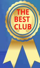
AWARDS AWARDS AWARDS