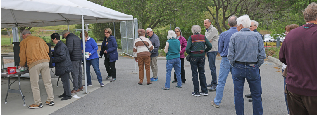
Outdoor lunch line for the meeting at the IVC Farm.