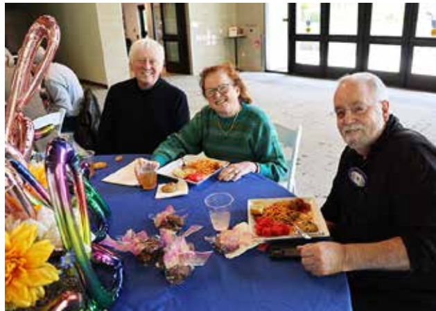
Celebration table at our Friday meeting.