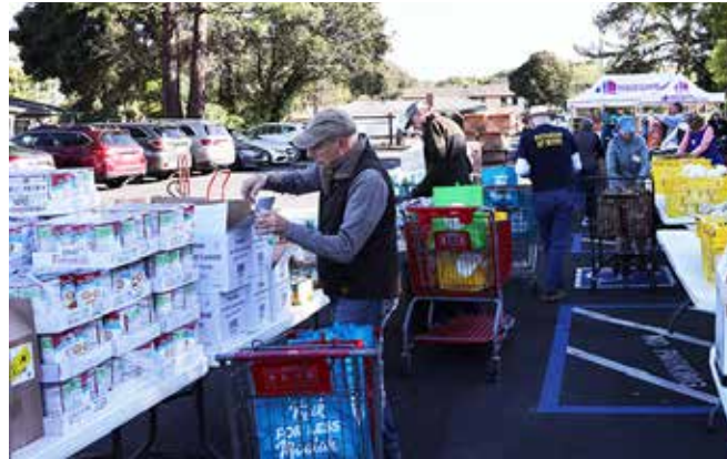
North Marin Community Services food drive.