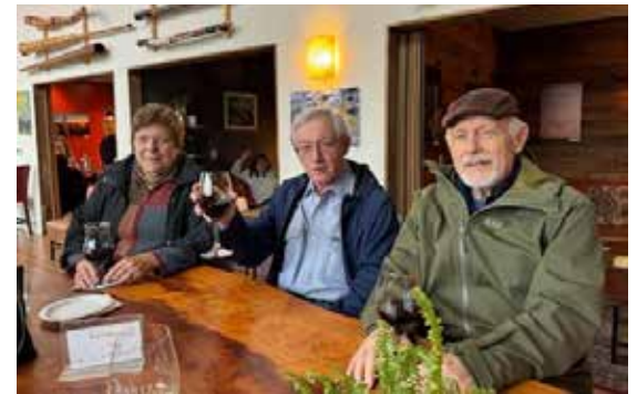
TGIF Club Social at Mantra Wines