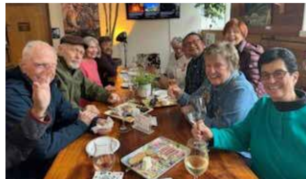
TGIF Club Social at Mantra Wines