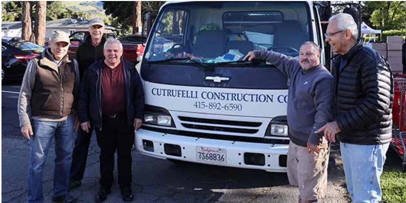
North Marin Community Services food drive.