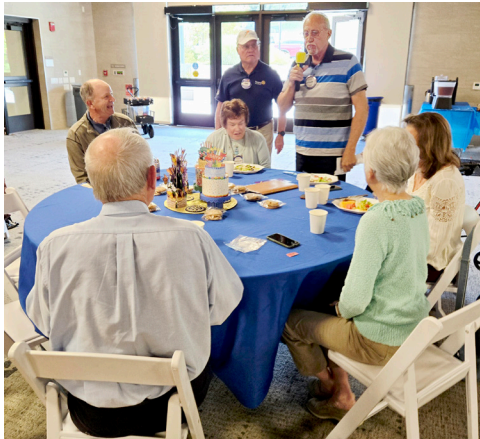
Frank Bruno speaks from the "Birthday Table".