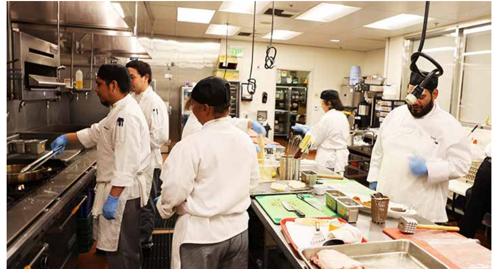
With permission I entered the kitchen of restaurant crew who prepared our lunch.