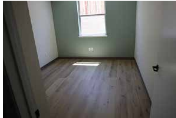
Spacious unit for one with furnished kitchen, large bathroom and sitting room opposite. Room adjacent to the kitchen.