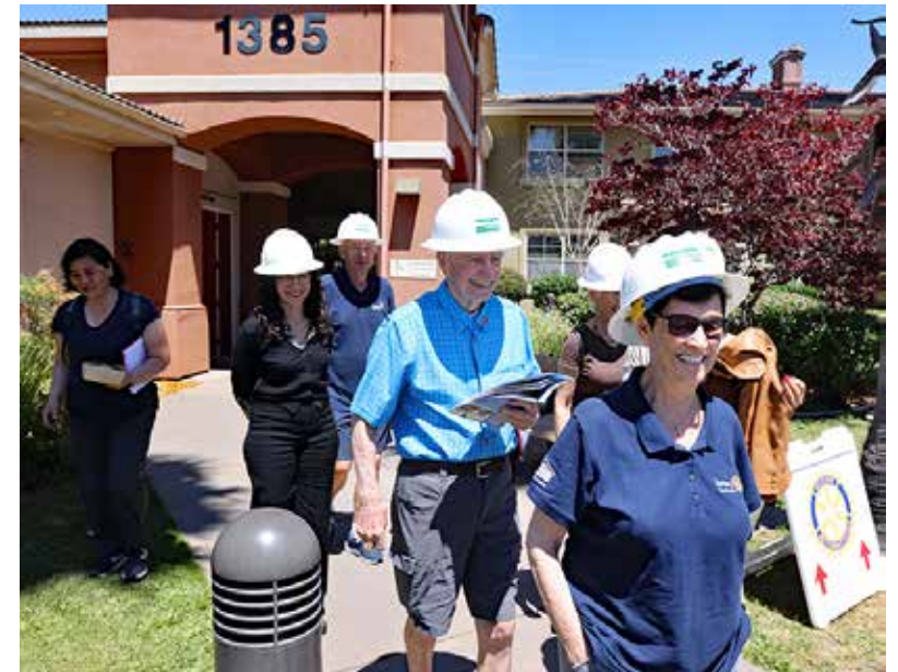
Group one of Vet apartment tour after lunch.