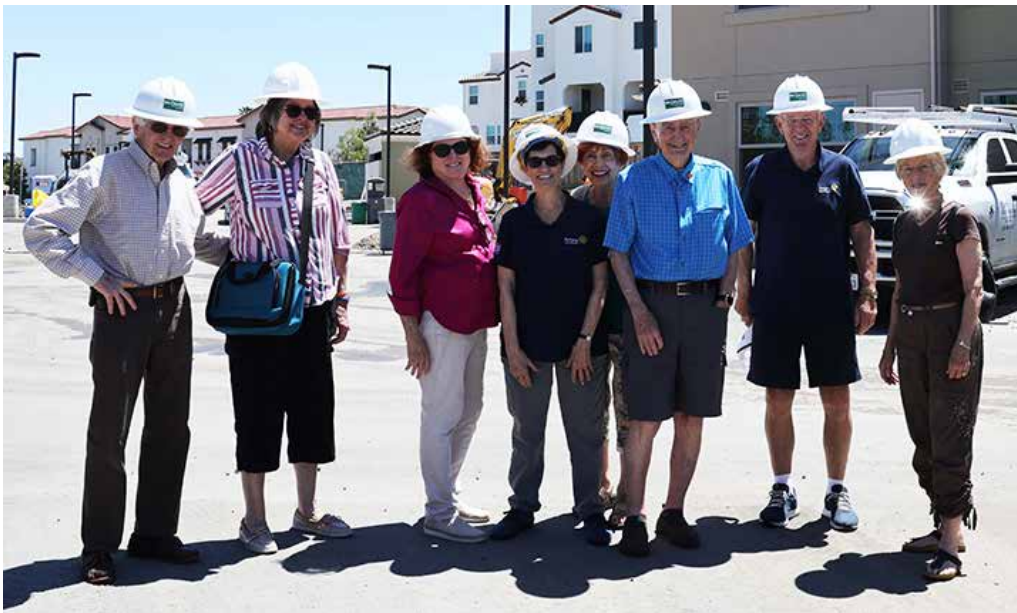
Group one ready for inside tour.