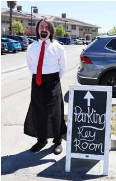
Greetings from Homeward Bound from Austin directing traffic.