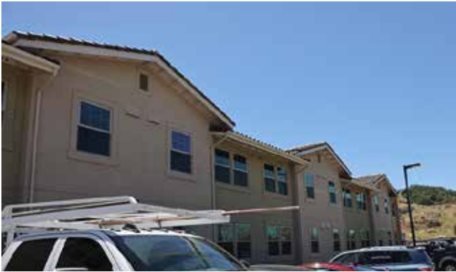
Vets apartments almost done and we saw inside in Hard Hat.