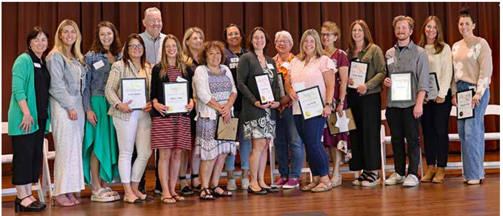
Rotary Club of Novato Teacher Recognition 2024.