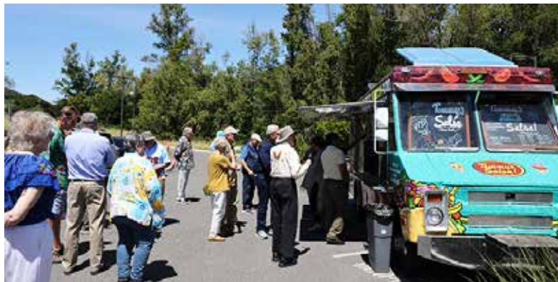
International Projects was fun and informative.