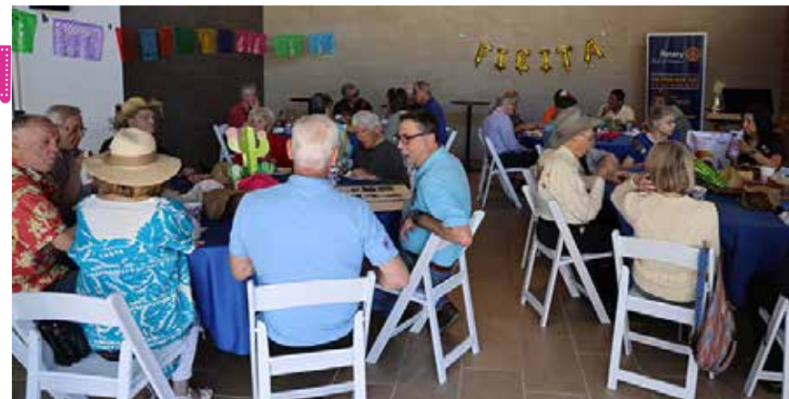
We ate indoors and out and enjoyed the May 5 decorations.