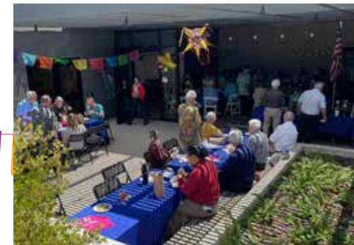
A wonderful carefree party atmosphere and a complete International Project summary.