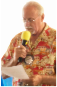
Frank Bruno with the Thought for the Day.