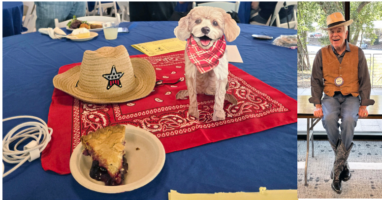
For our Good Old Days meeting theme, Polenta Feed decor, pie and Cowboy attire.