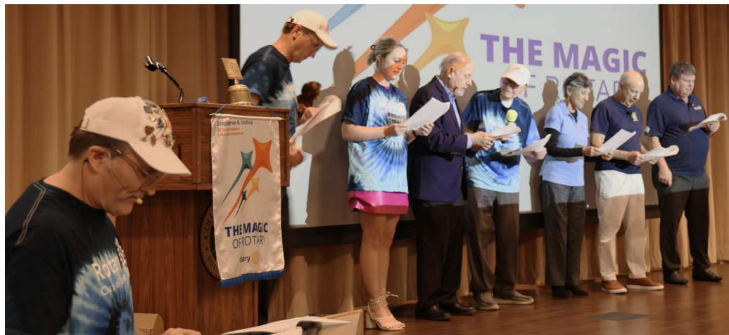
The Debunking team in action, providing great entertainment.