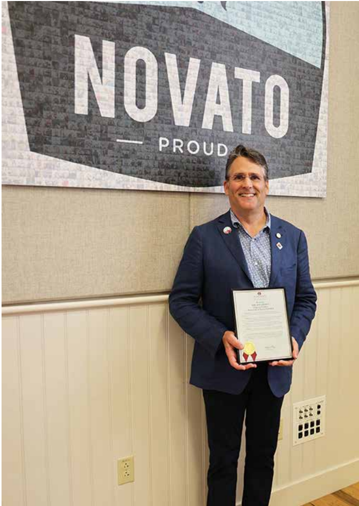
Phil's Award presented June 25, 2024 from Novato City Council.