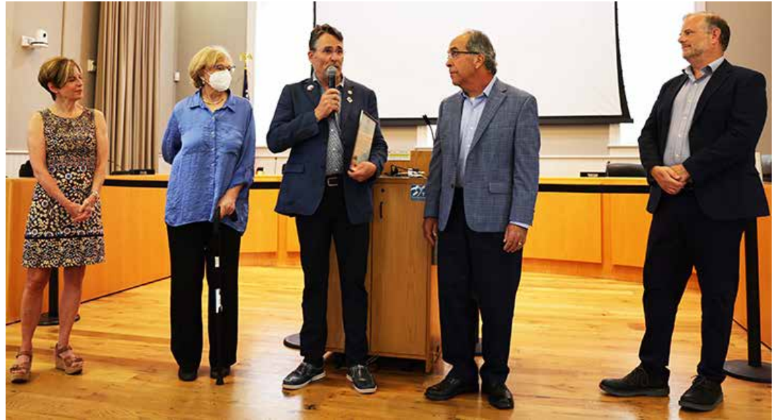
Phil thanks Novato Mayor and City Council.