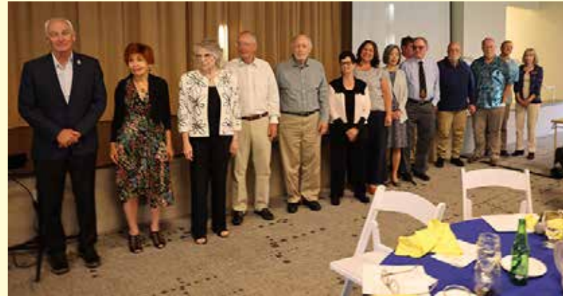
2023-2024 Officers and Board of Directors.