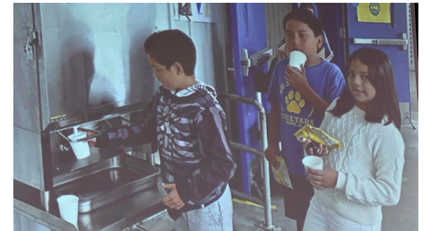
To reduce waste, milk dispensing machines replace individual cartons at Novato Schools.