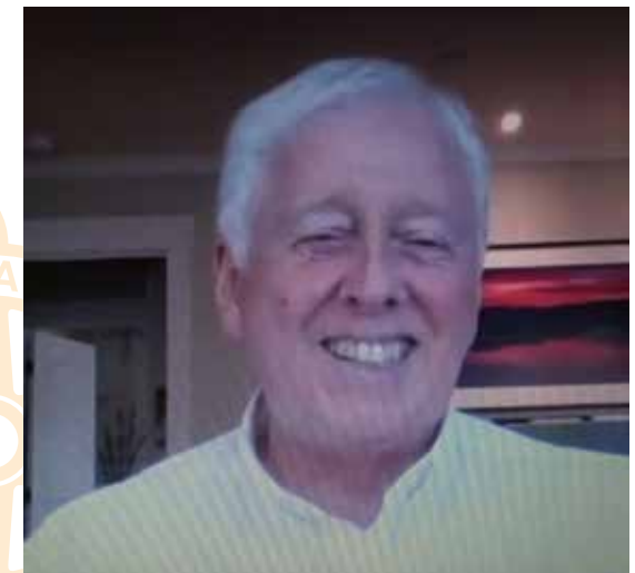
Director of Public Image thanked his Team.