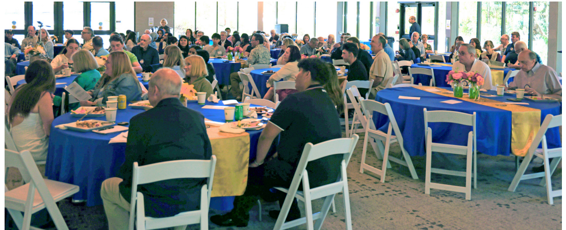
The Scholarship Awards are one of the most enjoyable meetings of the year. It was well attended as usual.