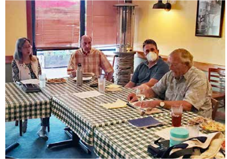
The Rotary Community Service Committee that meets the third Wednesday of every month at Mary's Pizza Shack.