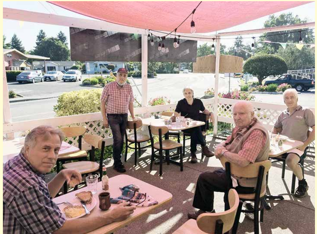
Rotary members with July birthdays celebrate with a meal at Sam's Place.