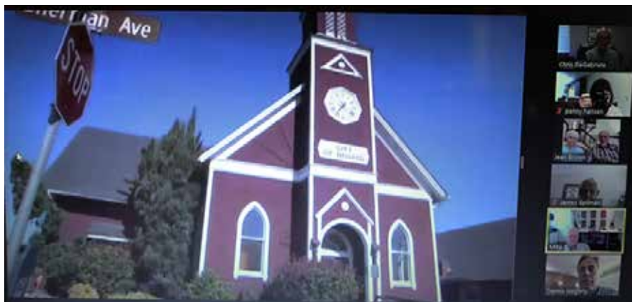
Salute to Novato.