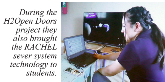
During the H2Open Doors project they also brought the RACHEL sever system technology to students.