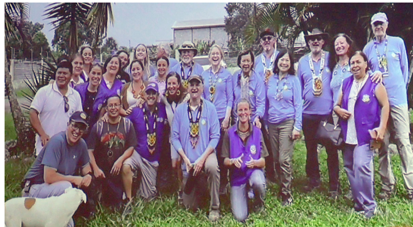
The H2Open Doors Team in Ecuador.