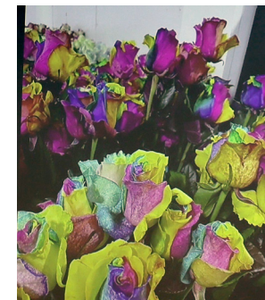
The team was treated by their hosts to tours and celebrations. One tour was of rose wholesaler. Here some very colorful roses were prepared for export.