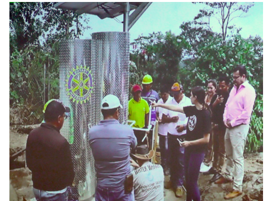
Testing a solar powered filtration system.