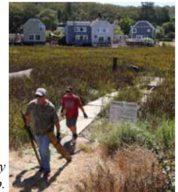
Rotary Club of Novato Community Service Bahia Lagoon cleanup.