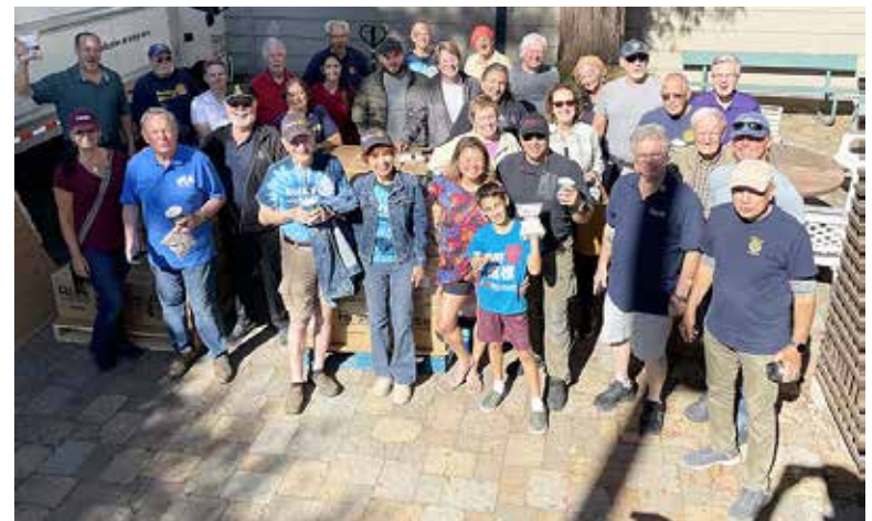
Rise Against Hunger, a combined Novato Project Sept 14.