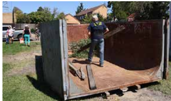
Rotary Club of Novato supported Debris Box.