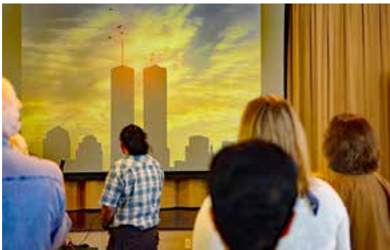
We honor our 9-11 First Responders.