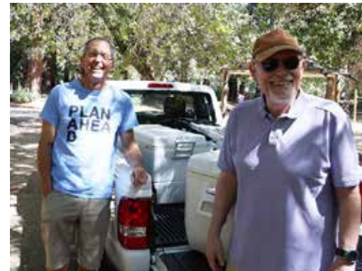
Beverage Crew with a truck full.