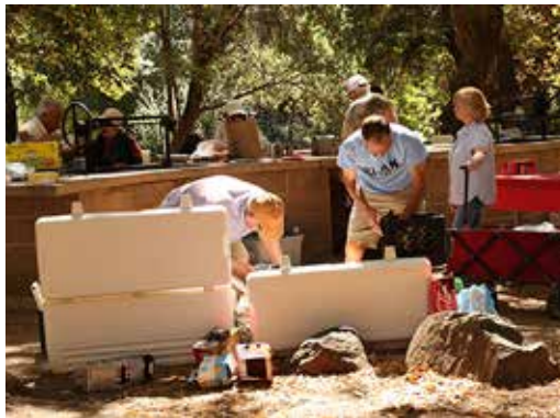
Beverage and food shuttle in wagons and truck.