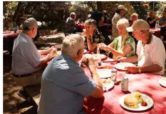
A lovely BBQ lunch sheltered in the trees with friends.