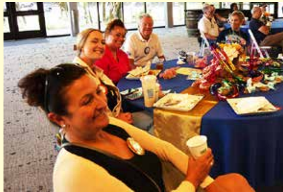
Celebration Table Fun.