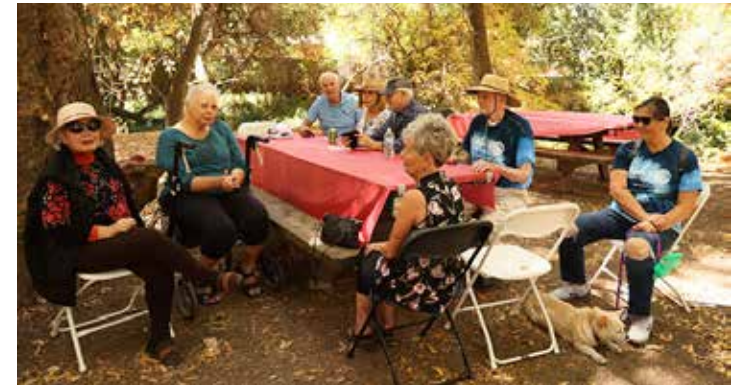
Enjoying a primal land.