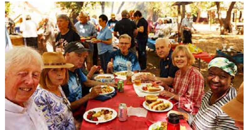
Miwok Park Cutrufelli grilled feast plus.