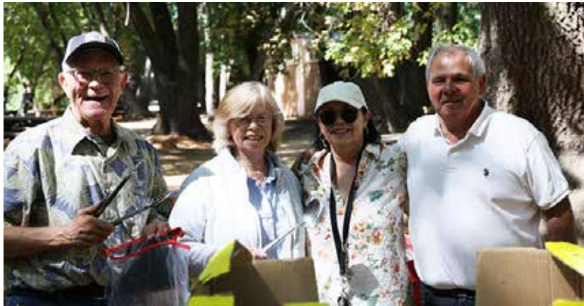
The A.M. Crew