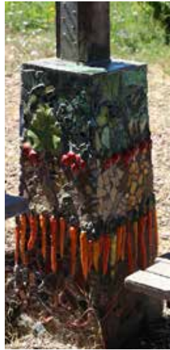
A surprise ceramic veggie foundation post.