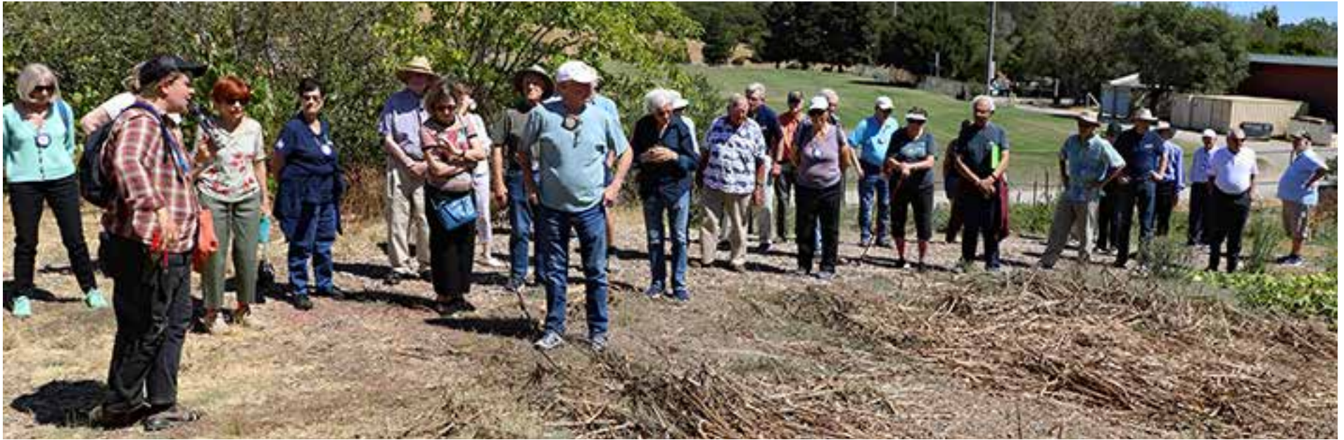
A short jaunt up the trail.