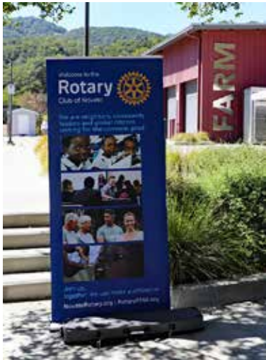
We drove to the end of the street at the IVC Commercial Chef Kitchen and adjoining classrooms at the entry of the Organic Farm.