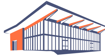
BILL AND ADELE JONAS CENTER