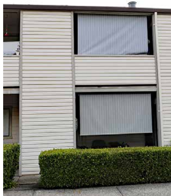
Newly installed sun shades at Nova-Ro II.