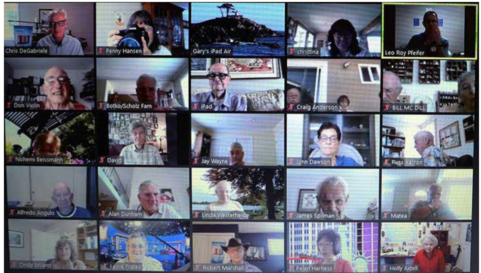
53 Zoom Meeting participants filled 3 screens!