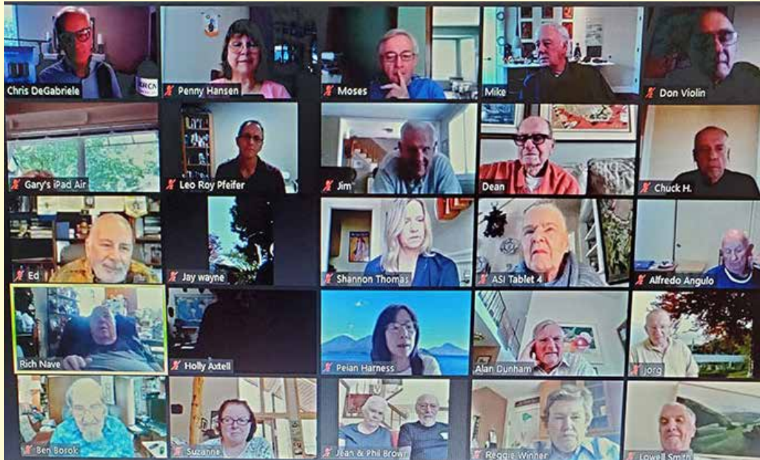
Zoom Meeting participants.