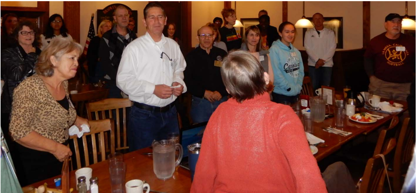
Each of the 4 participants spoke briefly: