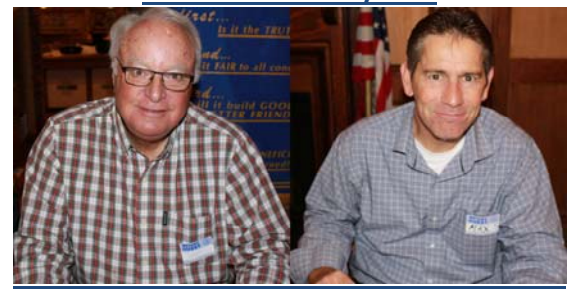
* * * * *