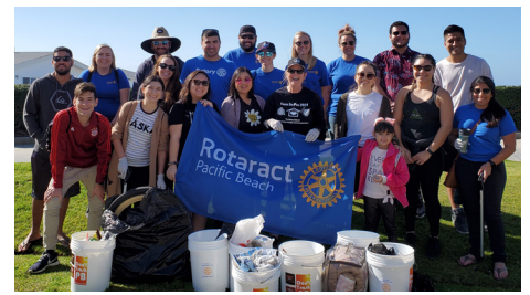
Pacific Beach Rotaract describes themselves as A group of young professionals in San Diego who enjoy volunteering together while focusing on professional develop ment and having a beer or two! Old Mission Rotary is proud to be one of their sponsoring clubs!