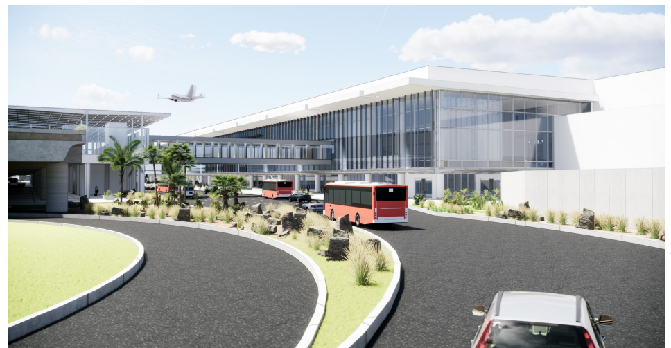
The new Terminal One will revolutionize the air traveller customer experience at our very busy San Diego Airport.

Construction is on schedule and even accommodates the local endangered Least Tern Bird population. The Terminal is scheduled to be open for business in 2027 and the wait will be worth it!