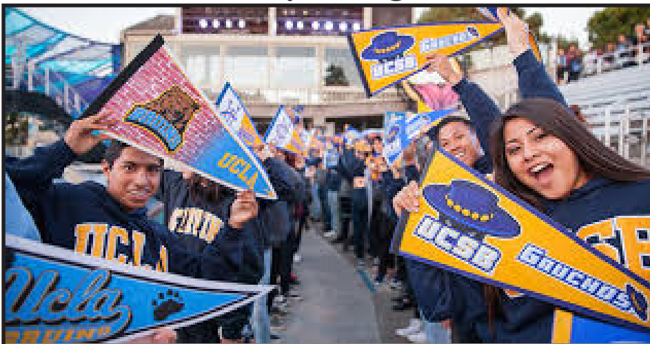
High School students from the Reality Changers program once again participated in our Old Mission Rotary club round of the Rotary District 5340 Four Way Test Speech Contest

Old Mission Rotary conducted the club round of the District 5340 Four Way Speech contest on February 15th. We look forward to this important and impressive event every year and this was our second time to have the contest on Zoom! Old Mission Rotary is one of many clubs across our Rotary District 5340 to sponsor a first round contest. The rules are all the same throughout the district and students have between five and seven minutes to deliver a talk that is judged on content, organization, delivery and application of the of the Rotary Four Way Test.