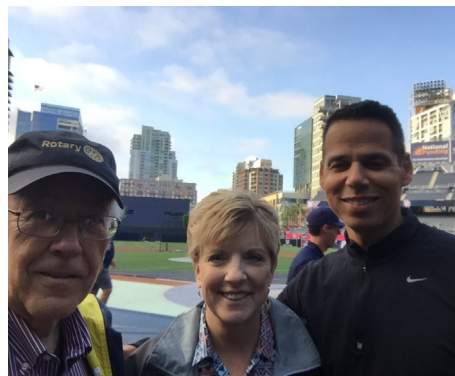
Members of Rotary District 5340 enjoyed an evening of fellowship and baseball at PETCO Park on Wednesday, April 26th.

The first District 5340 game of the season was a success with the Padres defeating the Arizona Diamondbacks by a score of 1-0.