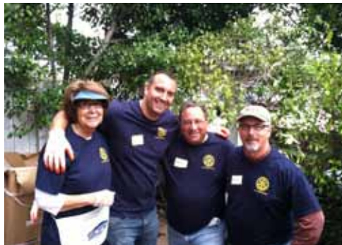
Our Old Mission Rotary work crew enjoyed the opportunity to do hands on labor during Rotarians at Work Day. Fortunately, the weather was cool and the predicted rain showers were over by Saturday morning. Manual labor uses different muscle groups than the check writing muscles in the hand and everyone admitted to being sore and tired the next day!

Board of Directors Meeting Mission Valley YMCA Thursday, May 8 Starting at 7:30am