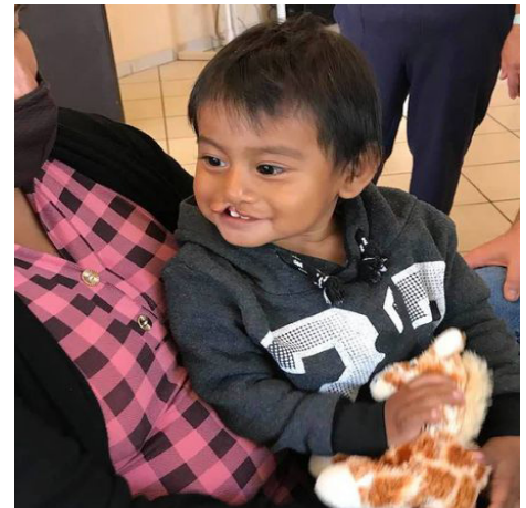
A young boy who had cleft lip surgery in the new operating theater at the Thousand Smiles May Clinic.