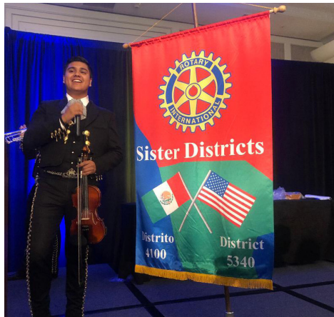
At the Governor's Dinner, District 5430 and District 4100 of Northern Baja reaffirmed their Sister District relationship. As was fitting. The evening's entertainment was an amazing Mariachi band!