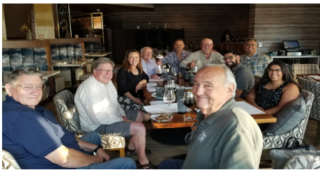
Members of Old Mission Rotary and Pacific Beach Rotaract enjoy our monthly evening no host social that takes place on the fourth Wednesday of every month at Teresa's Steakhouse at the Legacy Resort and Spa.