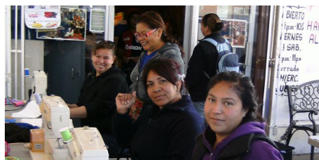
Sewing classes allow young girls and women to learn a trade.