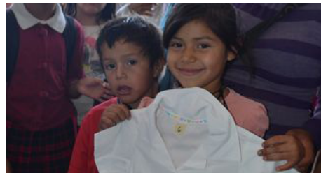
School supplies, haircuts and uniforms help kids get back to school.