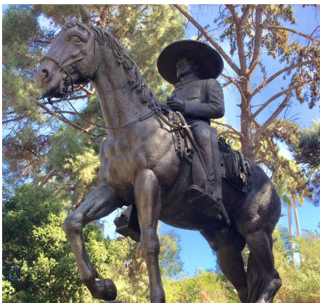
The highlight of the picnic was the unveiling of the public art statue "Fred Cutler on Horseback" by Mayor Faulconer in Presidio Park.