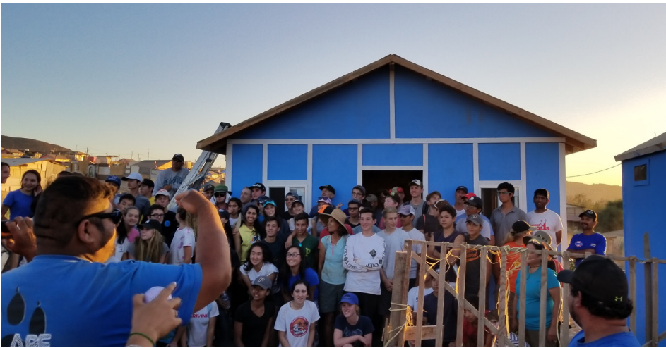
Group photo of the volunteers who participated in Project Mercy on Saturday, October 7th including members of Old Mission Rotary and Francis Parker Interact Club.