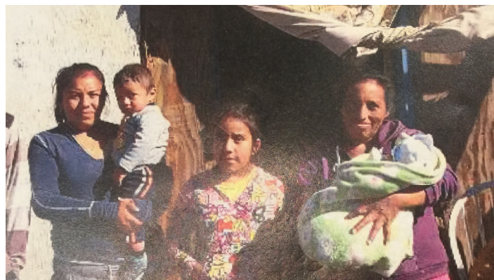
One of the 16 families that received a new small home free of charge after a busy day at Project Mercy!