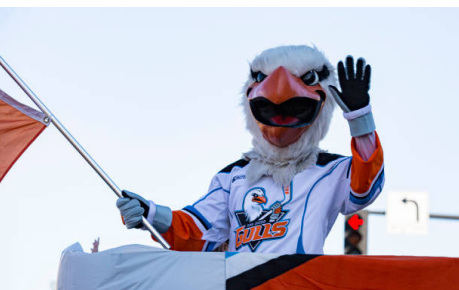
The mascot for the San Diego Gulls Hockey Club is named Gulliver.