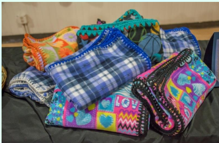
Blankets for the Linus Project

It was a friendly atmosphere for welcoming some old members who had been absent for a while and the evening deepened our warm relationship with the Inner Wheel members. Thanks for such a great evening.