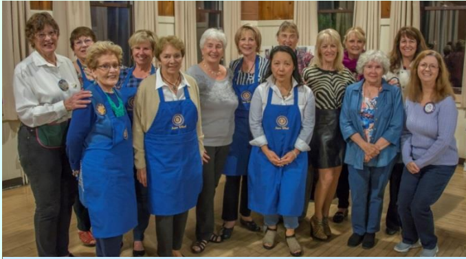
Inner Wheel members

Monday was the annual Inner Wheel spaghetti dinner. The ambience of our meeting room was transformed by charming hostesses and their creative decor. The striking color contrast of the table cloths, placemats, and napkins created a tone of elegance. The centerpiece candles were a crowning touch and even the raffle prize tables with violet gift sacs sparkled. My compliments to the interior decorators.