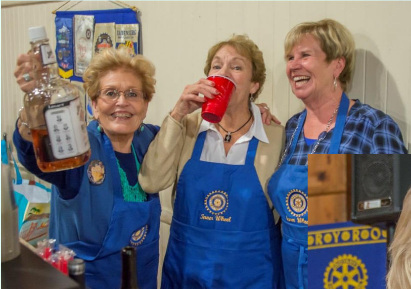
Inner Wheel bartenders