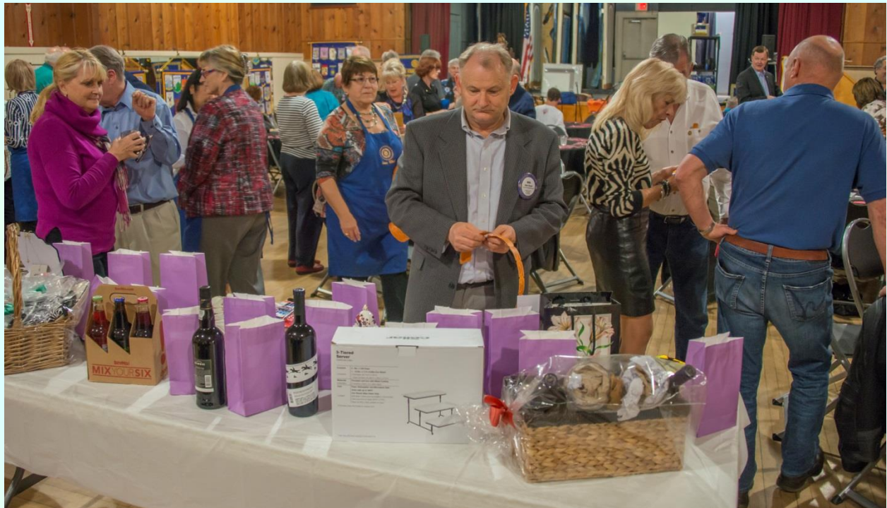
The raffle table