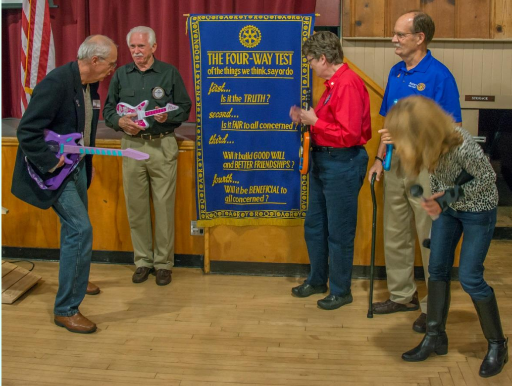
The conspirators (left) read the Four Way Test aloud to the club.