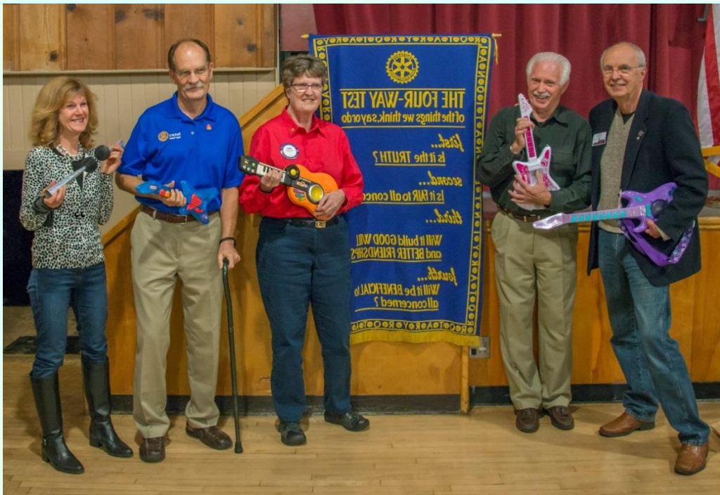
The Gang of Five Little Genius Conspirators (left) pose with their toy guitars and the Four-Way Test