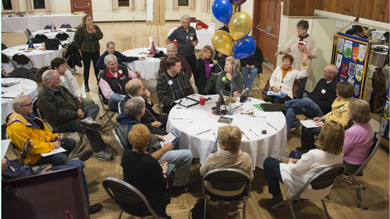
The first meeting of the Crab Feed Committee