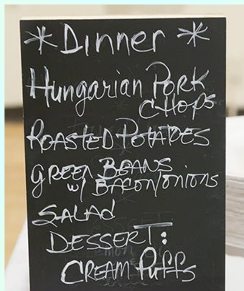
Another great dinner from our cooks. (Ed note: possible the best pork chops I have ever eaten)