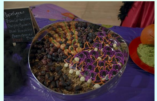
Halloween appetizers from our amazing cooks