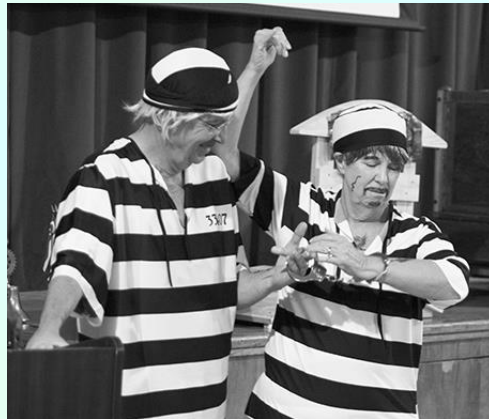
Straight Outta Folsom