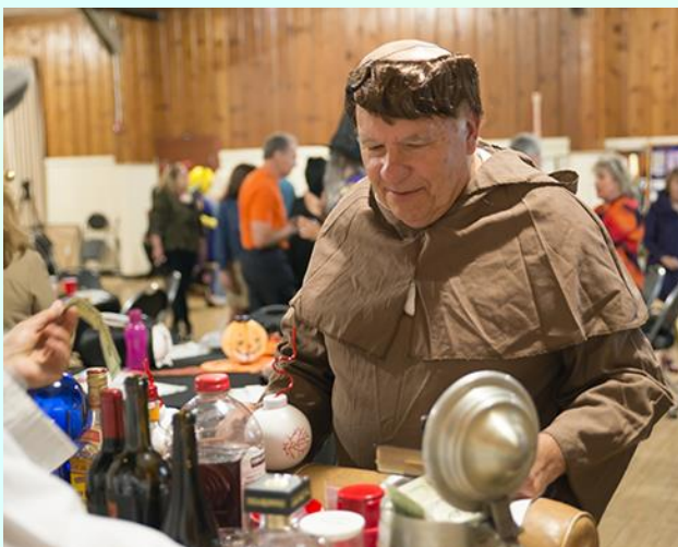
Friar Tuck - precisely where one might expect to find Friar Tuck