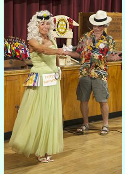
The Fairy Book Mother has a secret admirer