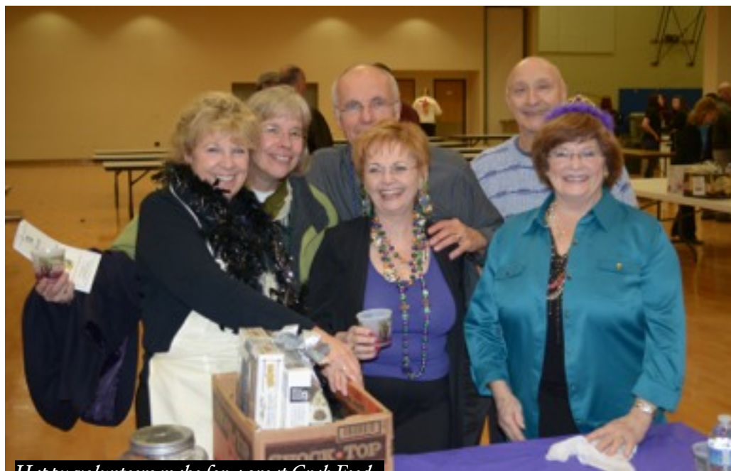
Happy volunteers make for a great Crab Feed

The 23rd Annual Crab Feed is history, but this special edition of The Acorn offers one last chance to enjoy in pictures and words this once-a-year event. With over 600 guests and volunteers, many