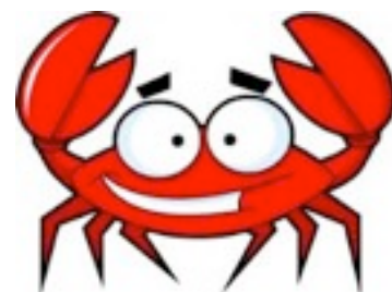
Special Crab Feed Edition

in Mardi Gras clothes, beads, and masks, this was a grand celebration that also happens to be our club's primary fundraiser for all the projects we do throughout the year.