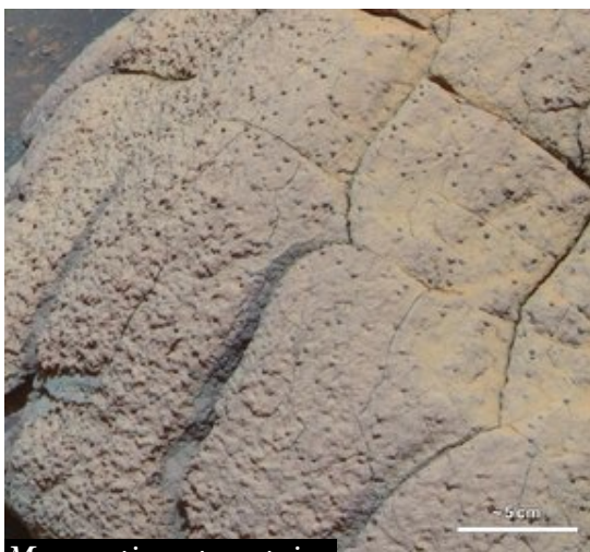
Mars continues to surprise