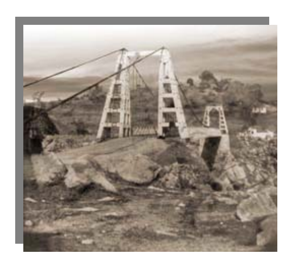
Suspension Bridge (where Rainbow Bridge now stands) Folsom, approx 1860