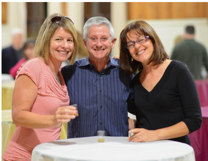
Happy Uncorked Guests!

Friday, October 12th, everyone who is anyone came out to party at this year's edition of Fair Oaks Uncorked.