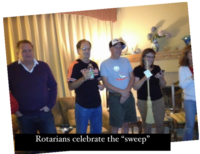
Rotarians celebrate the "sweep"

Beth led us in a cheer for the SF Giants winning the World Series, and expressed relief that tonight's