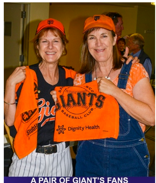
A PAIR OF GIANT'S FANS

meeting was not competing with a game 5 of the Series.