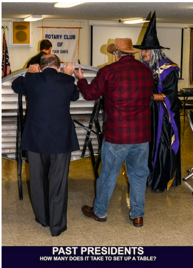
PAST PRESIDENTS HOW MANY DOES IT TAKE TO SET UP A TABLE?