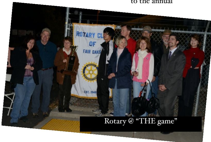
Rotary @ "THE game"

Speaking of football, this past Friday night, our club offering Vets free flag pins and admission to the annual